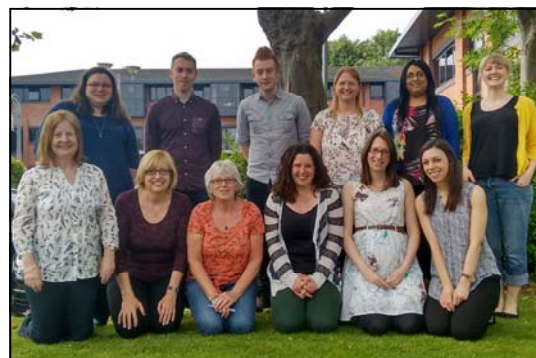
Members of the BSRBR-RA team, University of Manchester

If there is anything you would like to see in a future newsletter, please get in touch!